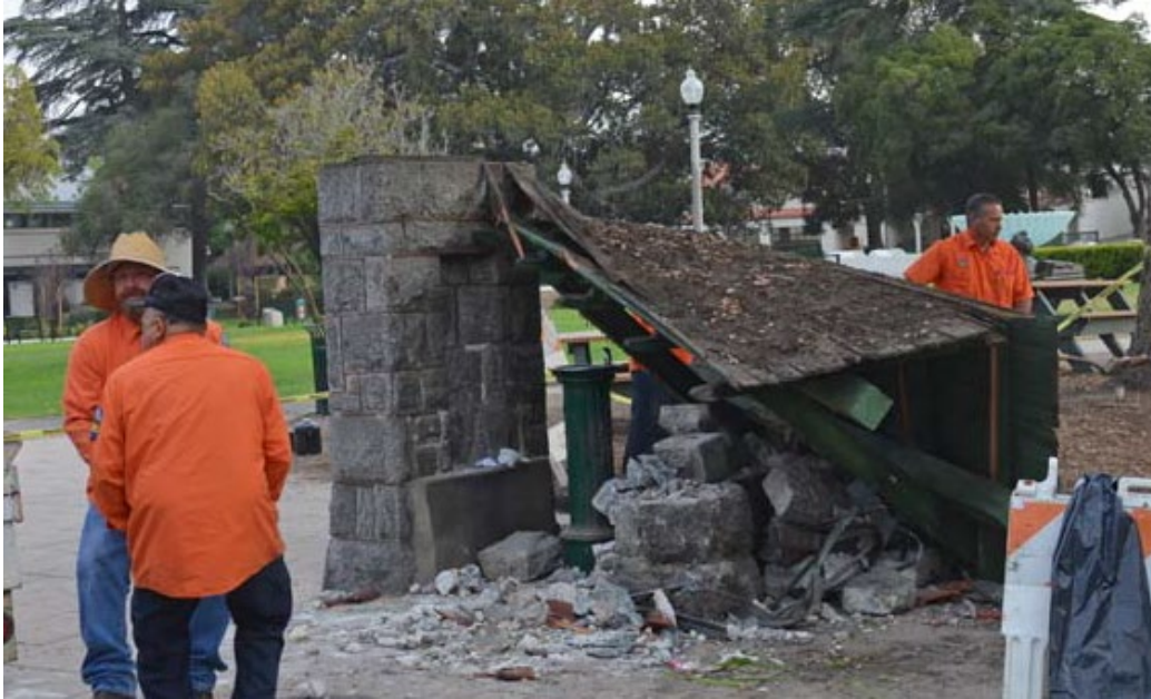
Figure 1- Public Works crew cleaning up after accident in 2013