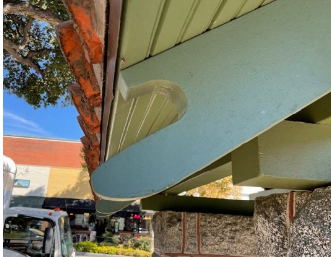
Figure 3 - Rafter tail detail (2021)