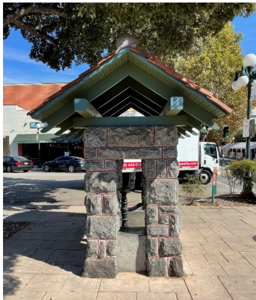
Figure 2 - Farmers Club Fountain, west elevation (2021)