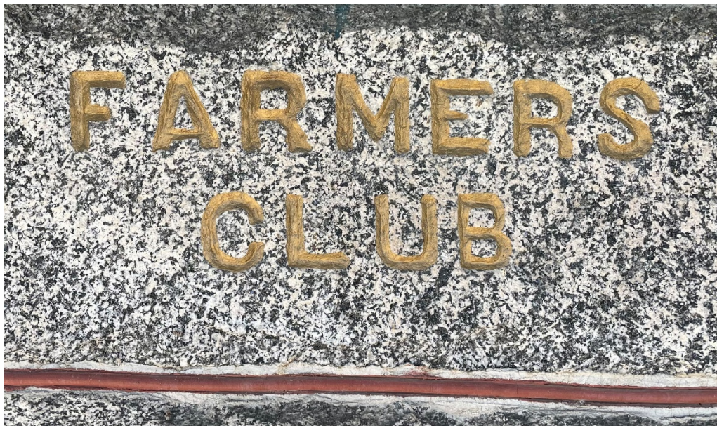
Figure 4 - Farmers Club inscription (2021)