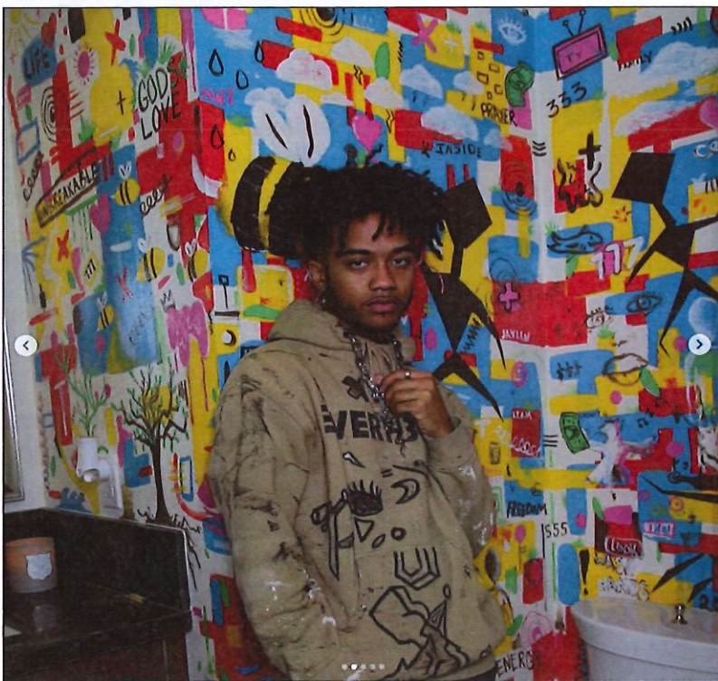
Interior Bathroom, North Hollywood—CA