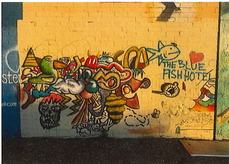
Chandler BLVD. In North Hollywood