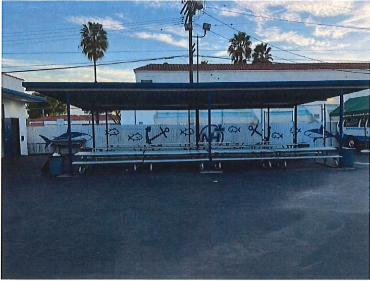
11330 McCormick St, North Hollywood, CA 91601