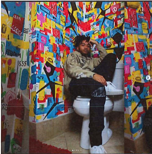
Interior Bathroom, Pasadena—CA