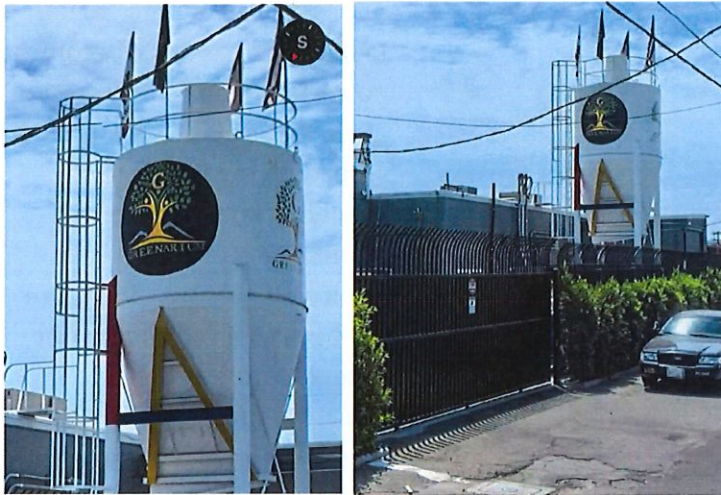
Satsuma Ave & Cumpston St NoHo Arts District, North Hollywood