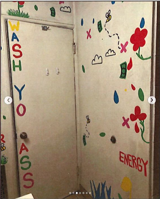
School Mural, Los Angeles—CA