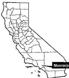
Fire Hazard Severity Zones (FHSZ) in Local Responsibility Area (LRA), as Identified by the State Fire Marshal